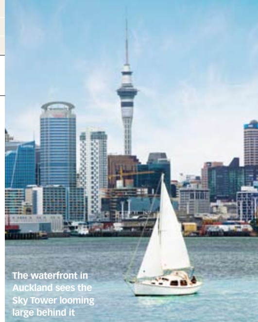
The waterfront in Auckland sees the Sky Tower looming large behind it

Known as the 'City of Sails', Auckland is New Zealand's biggest and busiest city, with waterfront cafés, quiet gardens, stylish cocktail bars and museums – all built near the craters of ancient volcanoes