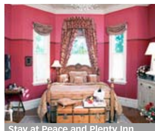
Stay at Peace and Plenty Inn