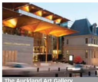
The Auckland Art Gallery