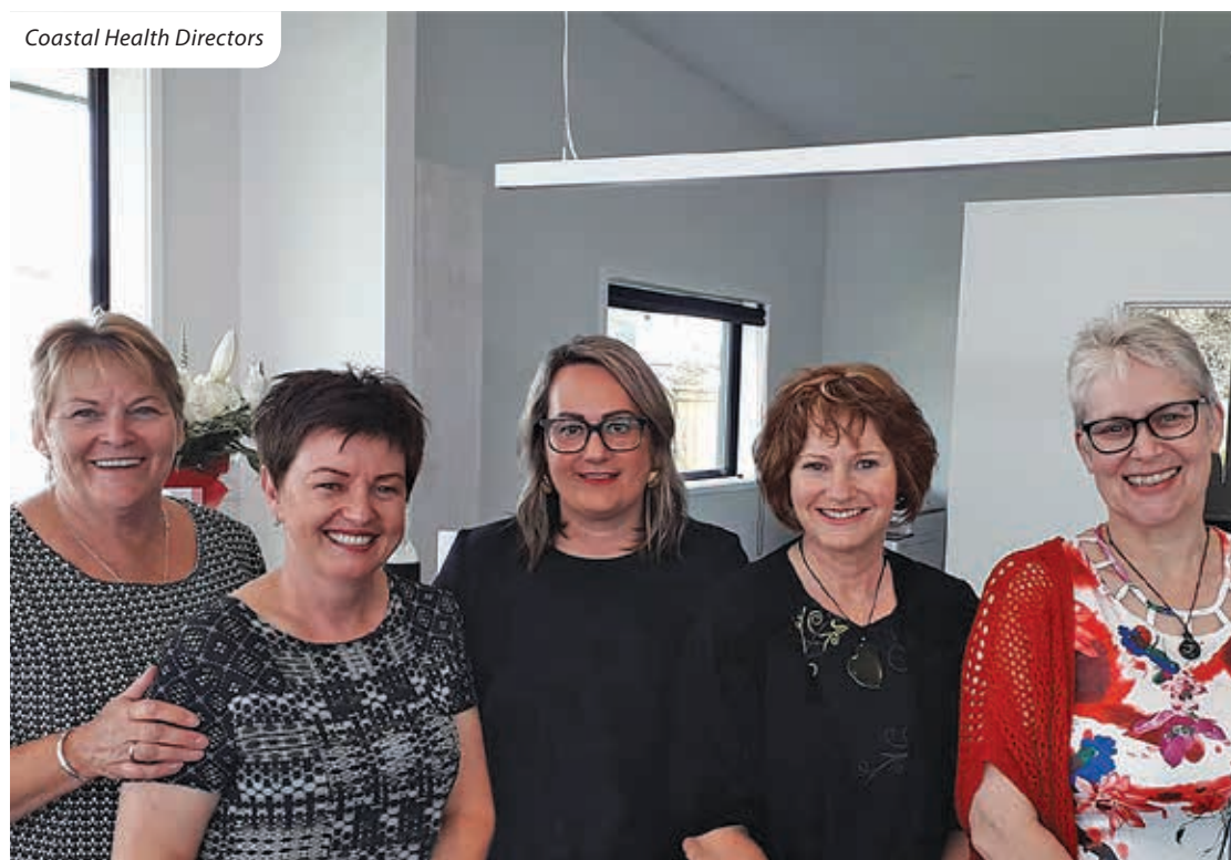
Coastal Health Directors

amongst the team have grown. The different personalities are enjoyed and often extend outside the work place." Coastal Health's success is not just the Directors' successes but all staff. No-one likes being sick and putting pressure on others. However, flexibility within staff to cover others and their workload during periods of illness, either of themselves or family members, is something the business pride ourselves on. Directors ensure staff know and are aware they are valued. "We often reinforce this with gestures of acknowledgment of birthdays, anniversaries, personal achievements work and non-work related and just when they have had a busy week."