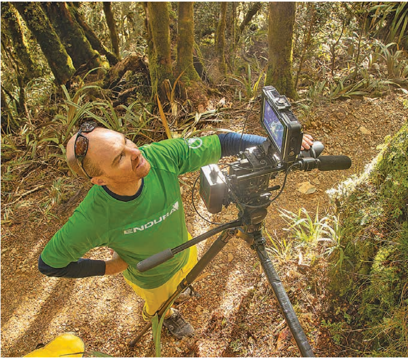
2016 Leading Light Awards

The videos will be screened at the Awards Celebration and are gifted to the businesses after the ceremony.