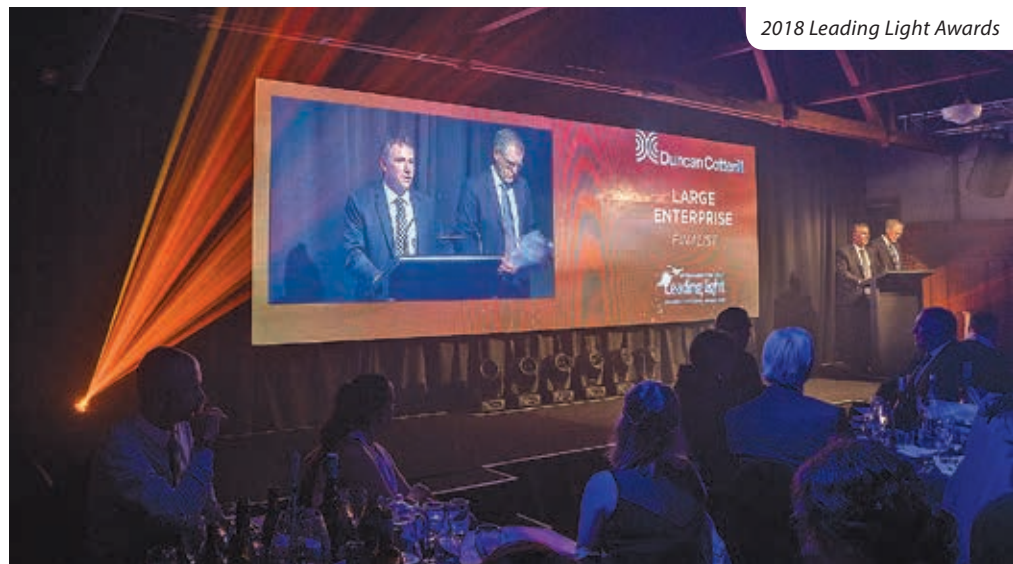
2018 Leading Light Awards