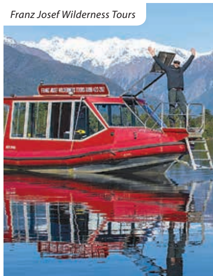
Franz Josef Wilderness Tours

Nestled amongst the Southern Alps, close to Franz Josef Glacier and countless other scenic spots, the Rainforest Retreat is the perfect base to explore New Zealand's Glacier Country and the wild West Coast. With our accommodation ranging from flashpackers, to motels, all the way up to 5* Deluxe units, there is truly something for every preference and budget. Following a day of adventuring, our onsite Monsoon restaurant and bar is the perfect space to wind down and relax. Guests can cosy up next to open log fires, whilst enjoying some tasty homecooked meals and delicious cold beverages.