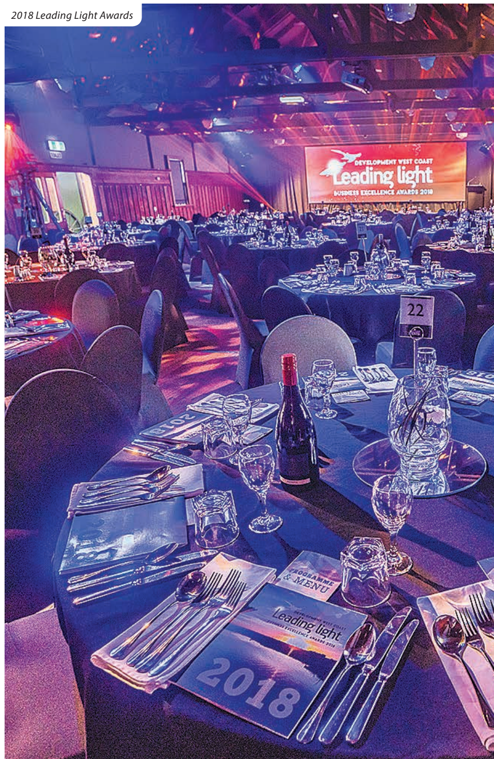
2018 Leading Light Awards

Skydive Franz and Fox Glacier is the pioneer of high altitude skydiving in New Zealand and was the first operator to be certified by CAA to conduct skydives from 20,000ft. Nobody jumps higher. Rated by Red Bull as one of the top destinations to visit, Skydive Franz and Fox Glacier has contributed significantly to making New Zealand a skydive destination of choice for world travellers. At Skydive Franz and Fox Glacier we are dedicated to reducing our impact on the environment, making our business more sustainable and are committed to making a difference to the communities within which we operate.