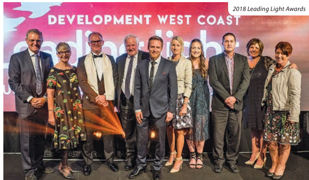
2018 Leading Light Awards

"There is so much to celebrate across our diverse region, and we look forward to being able to celebrate in person at the gala dinner."