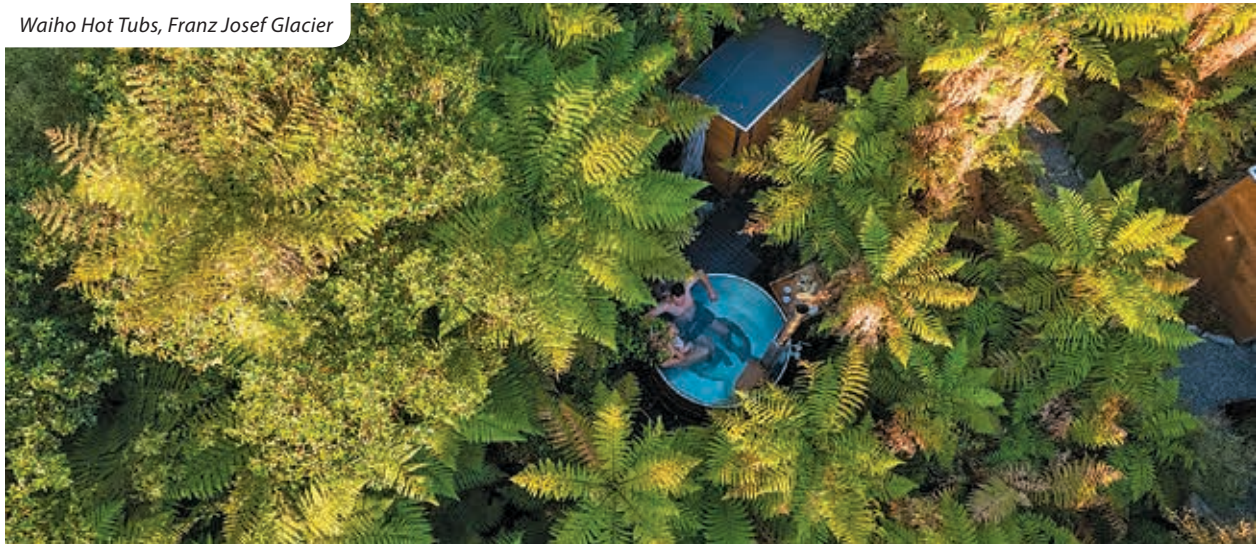
Waiho Hot Tubs, Franz Josef Glacier

The Greymouth Star is proud to sponsor the Rising Star Award at the 2018 Development West Coast Leading Light Business Excellence Awards. This award celebrates those who have been in business for less than five years and are already making a valuable contribution to the West Coast. The finalists in this category are all exciting new innovative businesses already making their mark on the Coast. We, along with Development West Coast, acknowledge the valuable contribution West Coast businesses make to our local economy, we congratulate and wish all the best to this year's entrants.