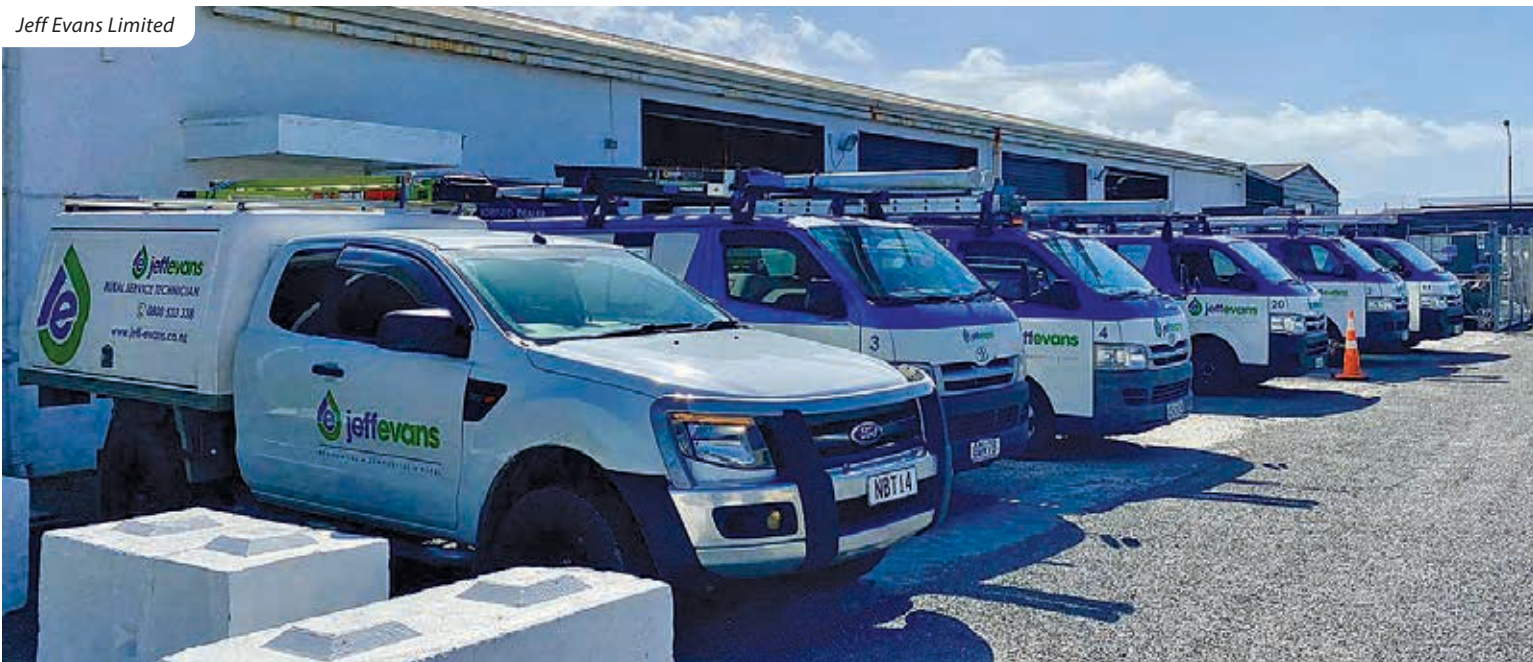
Jeff Evans Limited

WestReef Services Ltd is the largest civil construction company in the Buller District. Established in 1996, WestReef is now a Council Controlled Trading Organisation (CCTO). Our key purpose is to make a profit for the benefit of ratepayers and the wider community. WestReef is a key employer in the district, providing stable, responsible employment, with a focus on the wellbeing and development of staff. Over the past six years, we have shown consistent growth in revenue, profitability and staff numbers, while supporting the community across five key department - roading/ civil works, parks and reserves maintenance, services/utilities management, environmental projects, mechanical workshop.