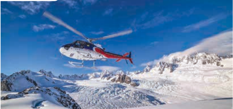
The Helicopter Line

With over 33 years' experience in providing services on the West Coast to residential, commercial, and rural customers, we have the knowledge and skills to get the job done to the highest standards. Our experienced team are here to help and offer friendly advice on all types of products and services from new bathroom fixtures, home heating, hot water systems and spa pools right through to offering design advice for new effluent systems, repairing, or replacing a dairy shed and designing and building your new home or commercial premises and so much more.